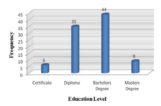
Fig 2: Respondents Level of Education

The respondents were well distributed with the majority 37 (39.3%) aged between 30-39%, 21(22.3%) aged between 18-29, 20(21.3%) aged above 50 years and 16(17.0%) aged 40-49 as indicated in Figure 3.