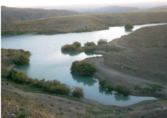
Figure 6. An artificial pond of Lead and Zinc mines around Marash village, Angouran area.