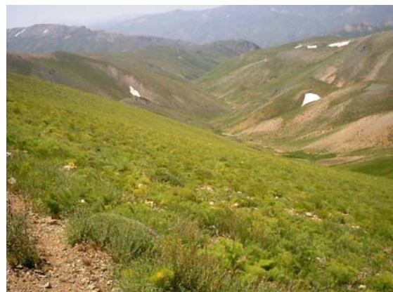
Figure 2. A view to Belghis Core Zone.