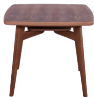
FI-TD4 W D H cm 90 90 76