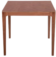
IV-TD4 W D H cm 90 90 76