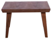
TU-TC1 | W D H cm | 60 60 39