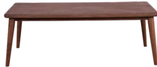
SU-TC3 W D H cm 120 60 39