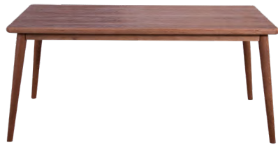
SU-TD8 W D H cm 200 90 76