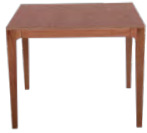
IV-TC1 W D H cm 60 60 39