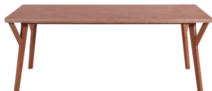
SE-TD8 W D H cm 200 90 76