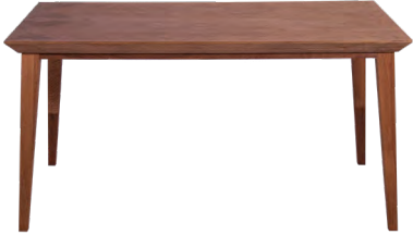
TU-TD6 | W D H cm | 160 90 76