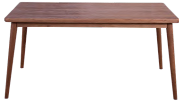
SU-TD6 W D H cm 160 90 76