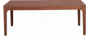
IV-TC3 W D H cm 120 60 39