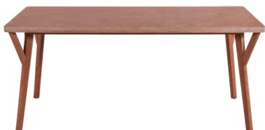
SE-TD6 W D H cm 160 90 76