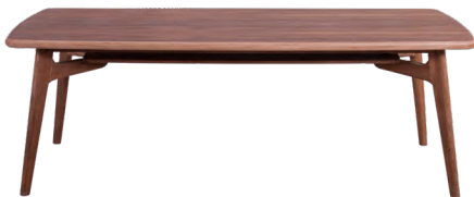
FI-TD8 W D H cm 200 90 76