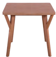
SE-TD4 W D H cm 90 90 76