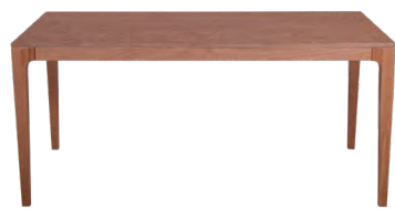
IV-TD8 W D H cm 200 90 76