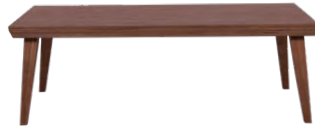
TU-TC3 | W D H cm | 120 60 39