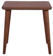
SU-TD4 W D H cm 90 90 76