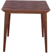
TU-TD4 | W D H cm | 90 90 76