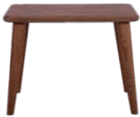
SU-TC2 W D H cm 90 90 39