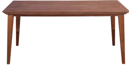
TU-TD8 | W D H cm | 200 90 76