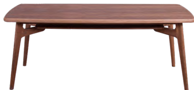
FI-TD6 W D H cm 160 90 76