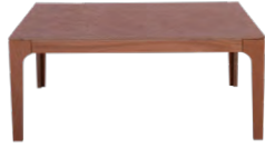
IV-TC2 W D H cm 90 90 39