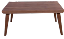
TU-TC2 | W D H cm | 90 90 39