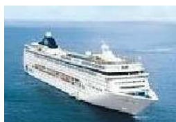
Make a voyage