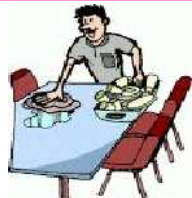
clear the table