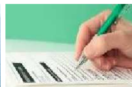
Fill out the form