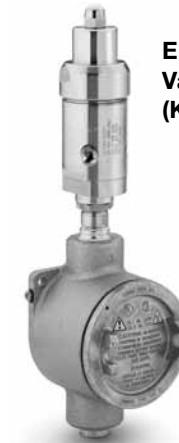
Electrically Heated Vaporizing (KEV Series), 38