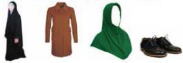
chador manteau scarf shoes