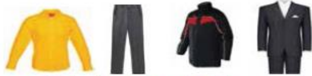
shirt trousers jacket suit