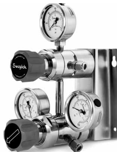
Shown with Swagelok tube fittings, not included.