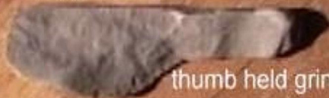
thumb held grinder