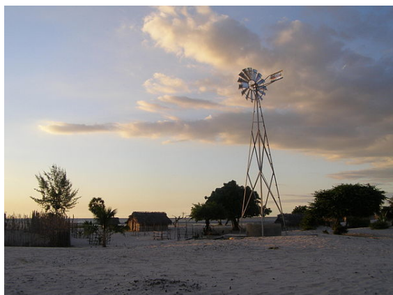
Wind and solar power such as this installation in a village in northwest Madagascar can make a difference in safe water supply.

Construction of wastewater treatment plants and reduction of groundwater overdrafting appear to be obvious solutions to the worldwide problem; however, a deeper look reveals more fundamental issues in play. Wastewater treatment is highly capital intensive, restricting access to this technology in some regions; furthermore the rapid increase in population of many countries makes this a race that is difficult to win. As if those factors are not daunting enough, one must consider the enormous costs and skill sets involved to maintain wastewater treatment plants even if they are successfully developed.