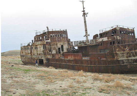
An abandoned ship in the former Aral Sea, near Aral, Kazakhstan.

Water scarcity has many negative impacts on the environment, including lakes, rivers, wetlands, and other fresh water resources. The resulting water overuse that is related to water scarcity, often located in areas of irrigation agriculture, harms the environment in several ways including increased salinity , nutrient pollution , and the loss of floodplains and wetlands. [6][47] Furthermore, water scarcity makes flow management in the rehabilitation of urban streams problematic. [48]