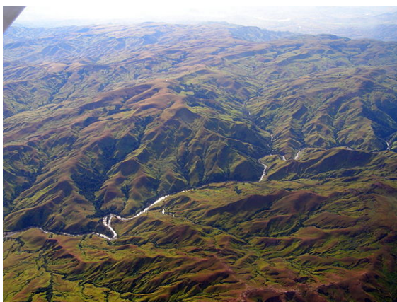
Deforestation of the Madagascar Highland Plateau has led to extensive siltation and unstable flows of western rivers.

In Europe extensive loss of wetlands has also occurred with resulting loss of biodiversity. For example many bogs in Scotland have been developed or diminished through human population expansion. One example is the Portlethen Moss in Aberdeenshire.