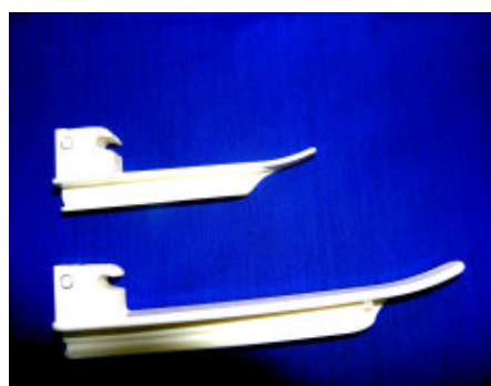
Fig. 2: Topster disposable laryngoscope

most of the glottis seen, only the posterior extremity of the glottis seen, no part of the glottis seen and neither the glottis nor epiglottis seen (Fig. 1). The brightness during laryngoscopy was also assessed using a visual analogue scale (VAS). The scale, a 10 cm line, was used for this purpose, with the word 'darkest' on the left side of the line and 'brightest' on the right side. Duration of tracheal intubation was described as the time from entering the laryngoscope into the oral cavity until passage of tracheal tube via the vocal cords. Self-reported anesthesiologist satisfaction was also described as favorable, acceptable and bad. Success of intubation was confirmed by capnograph and auscultation of symmetric bilateral ventilation. If arterial oxygen saturation was decreased below 85%, laryngoscopy was terminated and after enough oxygenation of patient, laryngoscopy was repeated. In addition, any problem associated with the use of the laryngoscope such as damage to the blade or loss of light during laryngoscopy was recorded (Fig. 2).