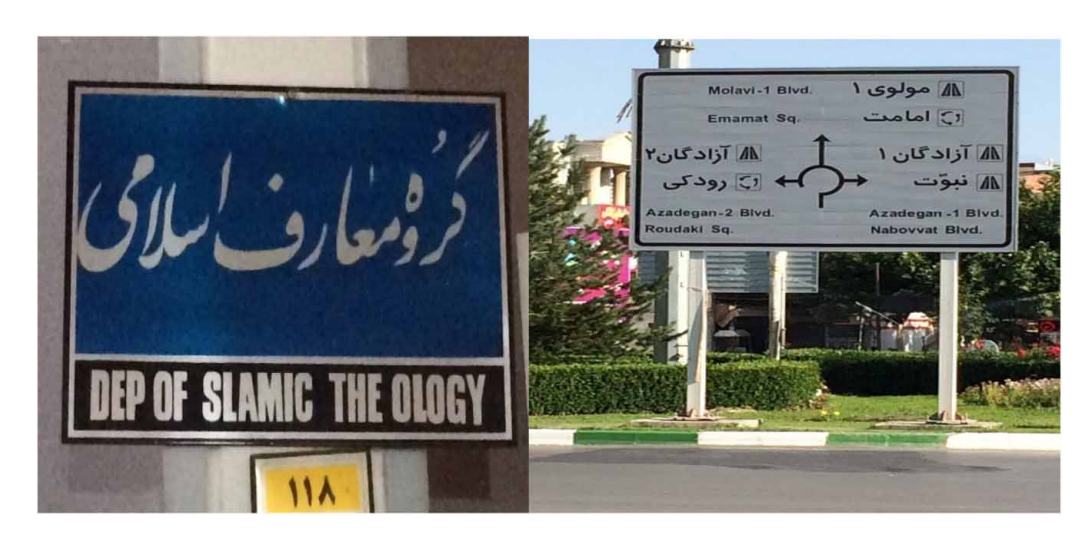
Figure 5. (Left) Department of Islamic Education (Urmia University). (Right) Street sign (at Azadeghan Square).