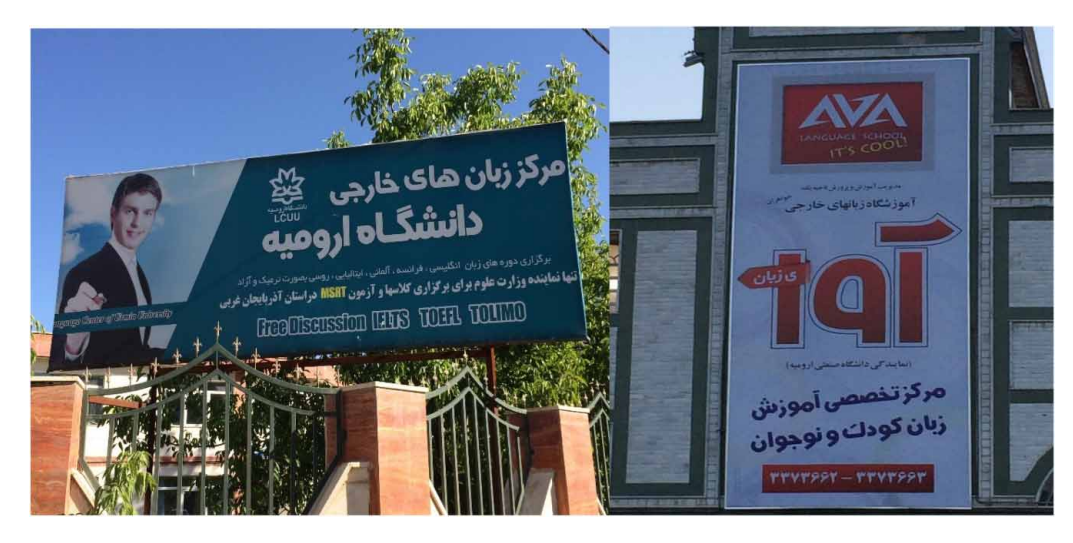
Figure 3. (Left) Urmia University Language Centre ad for courses on English, German, Italian and Russian as well as TOEFL, IELTS, TOLIMO/MSRT (Iranian version of TOEFL). (Right) AVA TALK Language School (Urmia University of Technology) ad for English courses for kids.