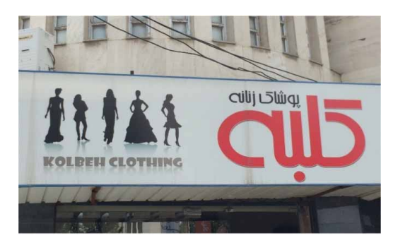
Figure 1. Kolbeh [cottage] female clothing.