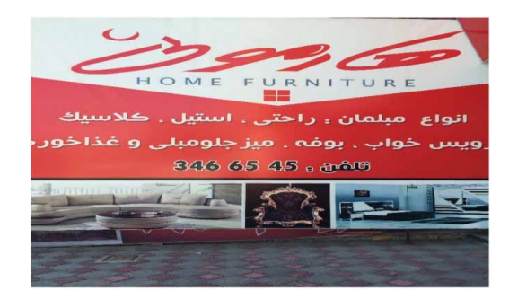
Figure 2. Harmony home furniture.

Better-known institutes in Urmia typically place such ads on billboards in areas where residents enjoy a higher socio-economic status. Institutes also advertise in local business-oriented newspapers and magazines as well as on their own websites. Rather than marketing their courses though stressing the affordances knowledge of English can bring, institutes may refer to the quality of their facilities (e.g. technological support, well qualified teachers, being affiliated to a university [Figure 3, left and right], unique features [Figure 3, left and right], etc.), the number of branches the institute has, as well as their use of widely recognized EFL (English as a Foreign Language) textbook series such as Top Notch, Headway or Interchange (Figure 4, right). The contents of almost all ads are exclusively in Persian (Figure 4, left) except for the name of the institute and the title of the courses they offer.