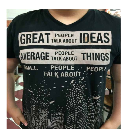
Figure 7. A teenager T-shirt.