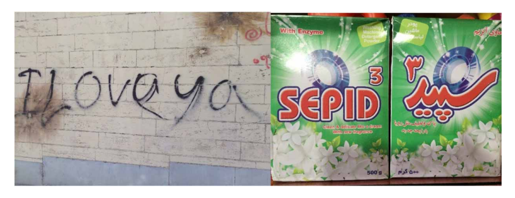
Figure 8. (Left) Writing on a wall. (right) SEPID detergent.

fashion (Figures 1 and 7); English is being cool (Figures 1 and 2); and English is for expression of love (Figure 8, left).