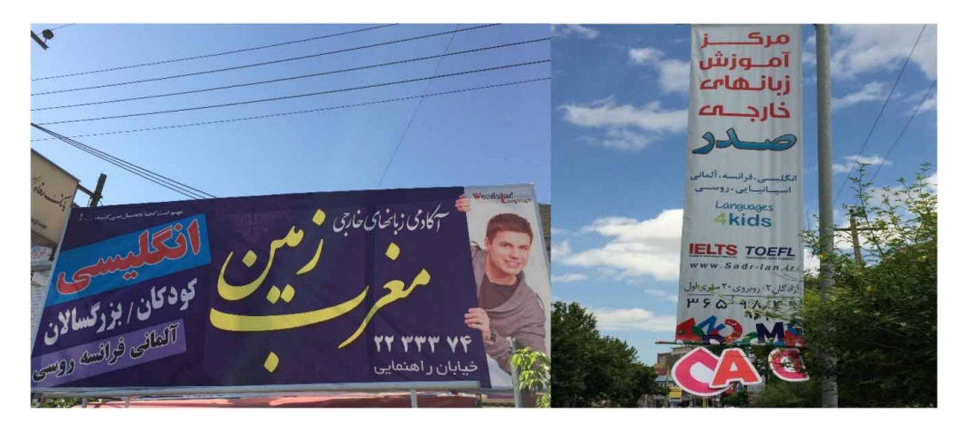
Figure 4. (Left) Maghreb Zamin (Westland) Language Academy ad for courses on English, German, French and Russian for kids and adults. (Right) SADR Language School ad for English courses for Kids as well as German, French, Spanish, and Russian.

companies and language centres publish their job announcements in English, although this is not very common.