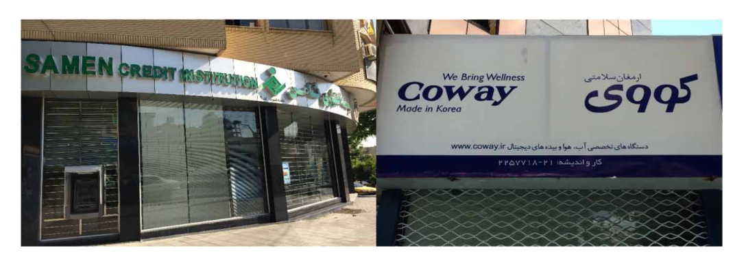
Figure 6. (Left) SAMEN Private Bank. (Right) COWAY air/water conditioners.

English (along with Farsi) is also found on almost every domestic product such as dairy products, electric devices, food and household items, although there are many other imported foreign products (especially housing appliances and medication) which carry an English label only (or English along with another foreign language). People who have not received any exposure to English or any foreign language written in Latin script such as German, French and Turkish, generally assume such words are 'English'. Young people are often seen wearing clothing items with English words or phrases printed on them (Figure 7), which is perhaps seen as 'cool'. They may not be aware of what the words mean or that the meaning may sometimes be offensive to religiously inclined people. Their use by young people may even serve to mark a distinct and different identity from people with more traditional values.