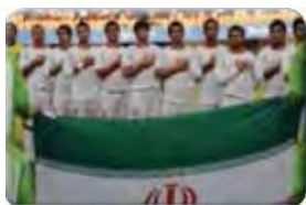
sing the national anthem