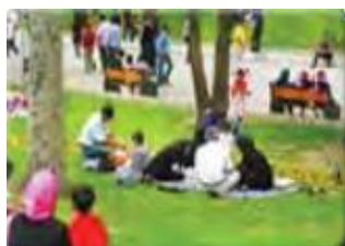
go out on Nature Day