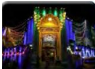
celebrate a religious holiday