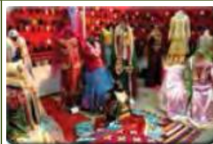
wear special clothes