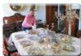
set the table