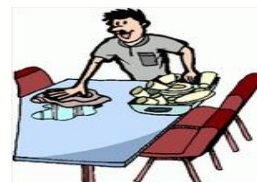
clear the table