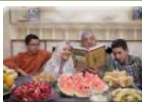
read poems of Hafez