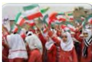
hold a ceremony