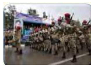
watch military parade