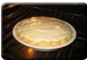
bake a cake