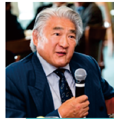
Prof. Li Shiguang