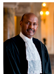
H.E. Judge Abdulqawi A. Yusuf