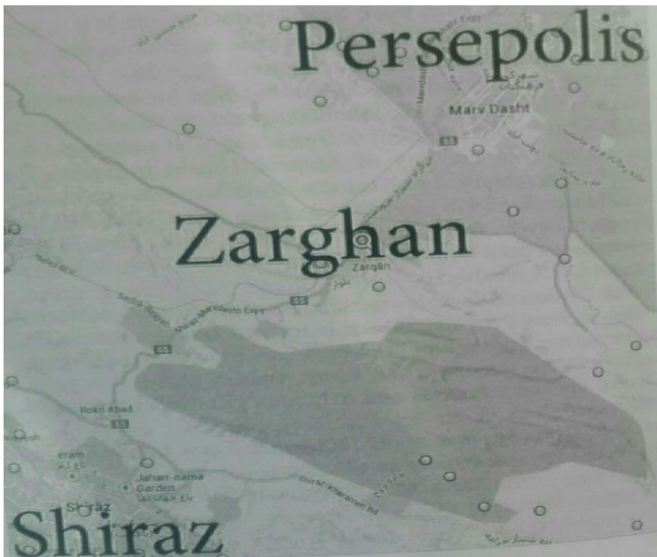
Shiraz – Persepolis Road and location of Zarghan