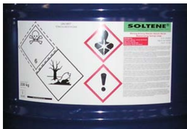
Ex: SOLTENE label

To our present knowledge, the information contained herein is accurate as of the date of this document. However, we do not make any warranty, express or implied, or accept any liability in connection with this information or its use. This information is for use by technically skilled persons at their own discretion and risk and does not relate to the use of this product in combination with any other substance or any other process. This is not a license under any patent or other proprietary right. The user alone must finally determine suitability of any information or material for any contemplated use, the manner of use in compliance with relevant legislations and whether any patents are infringed. We reserve our right to make additions, deletions, or modifications to the information at any time without prior notification.