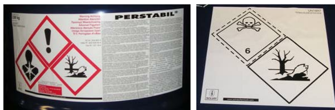
Ex: PERSTABIL labels