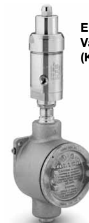
Electrically Heated Vaporizing (KEV Series), 38