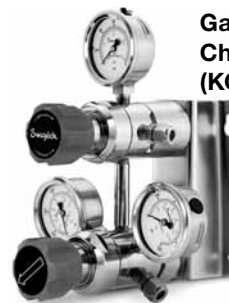
Gas Cylinder Changeover (KCM Series), 34