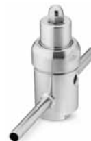
Steam-Heated Vaporizing (KSV Series), 36